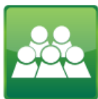
Up to 5 users